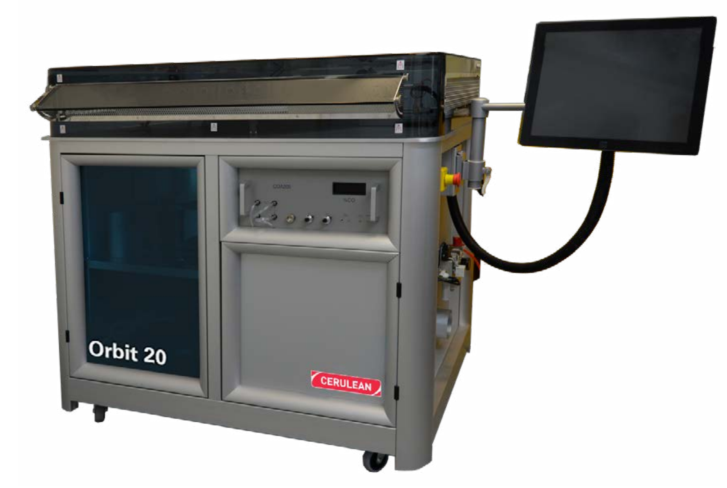
Figure 1: The newly enhanced Orbit 20 rotary smoking machine

The TPM results obtained from these tests on both machines (see table 1), showed improvement work was needed for the Orbit 20 to increase the aerosol captured from sample I and G by eliminating a very minimal dead volume.