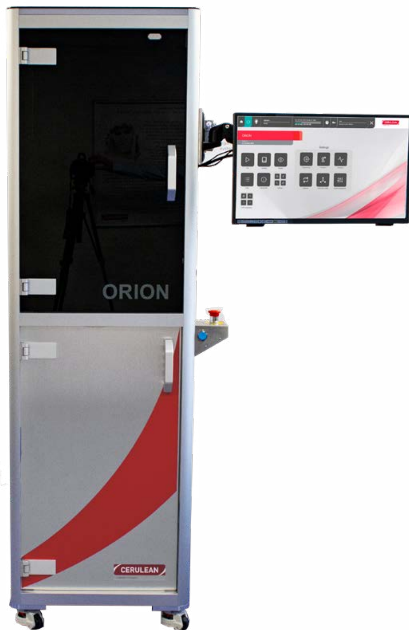
Figure 1: The Cerulean Orion modern oral pouch Test station

Being able to accurately assess the moisture content of finished pouches - as well as dimensional accuracy, weight and pouch tensile strength - close to the production line gives manufacturing professionals the tools to optimise their processes. The Cerulean Orion test station delivers this ability.